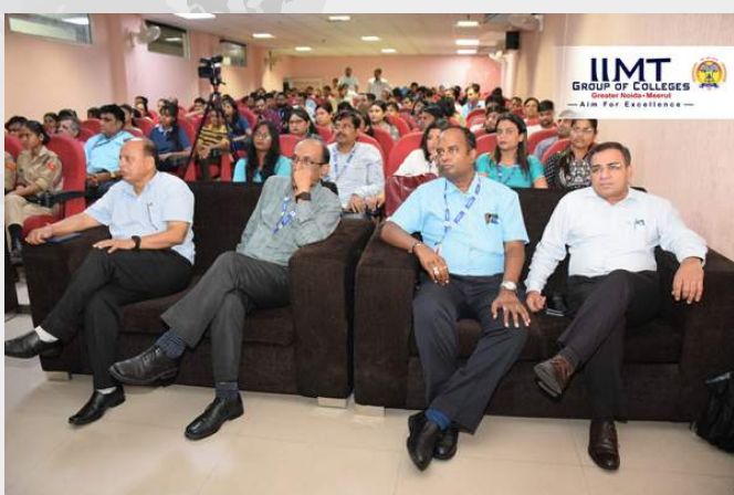
All the Faculty members watching Moon landing virtually by ISRO