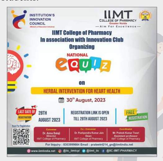
Banner of the E-Quiz

The national e-Quiz competition was organized by IIMT College of Pharmacy, Greater Noida. The event was organized bythe Innovation cell of IIMT College of Pharmacy, Greater Noida via virtual mode in the Seminar Hall of IIMT College of Pharmacy. The session received a response of 526 participants and was attended by Pharmacy professionals and students.