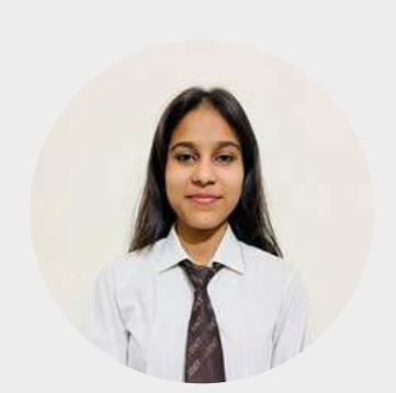
By Anjali B.Pharm (4th Year)

Androgen excess, metabolic syndrome, and polycystic ovarian syndrome impact acne severity. Recent research in European populations highlights genes like SNP rs4133274 on chromosome 8q24, offering hope for better treatments. Ongoing studies assess acne medication safety, dietary factors, scar treatments, and lifestyle influences. Genomic research aims to uncover genetic links to acne, shedding light on prevention and treatment, while investigating sebum production and inflammation from Propionibacterium acnes remains a priority in understanding acne's causes.