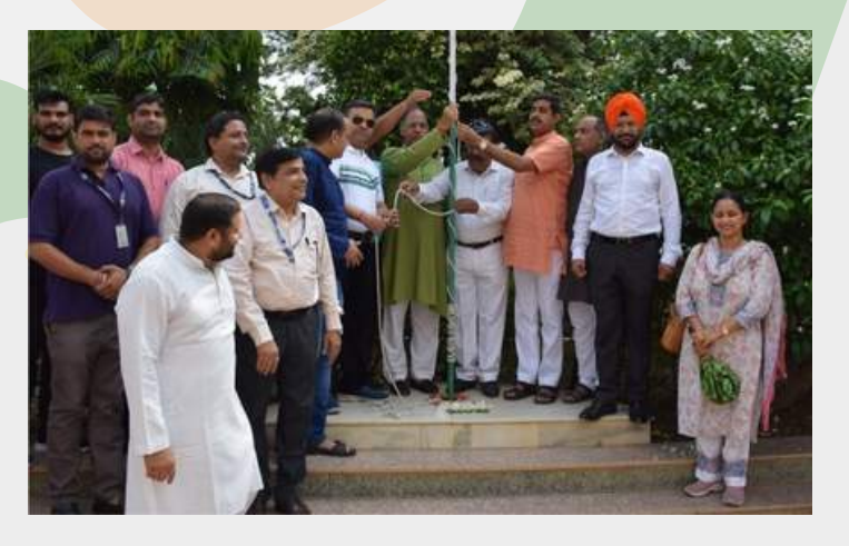
Celebration of Independence Day at IIMT Group of Colleges, Greater Noida